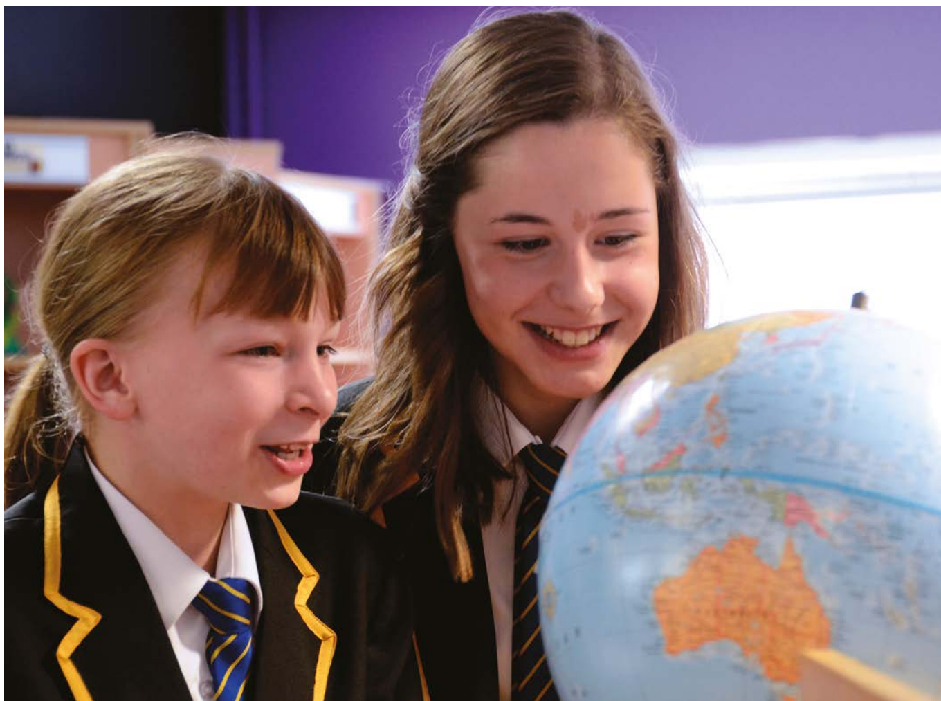
Students at Ipsley CE RSA Academy

The RSA's mission is to find innovative practical solutions to social problems. We do this through hands-on projects, research and our 27,000 Fellows around the world.