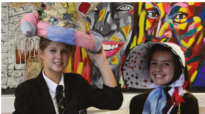
Students from Whitley Academy wearing hats they designed

Through the RSA Academies Teaching School Alliance we encourage teachers and learners to investigate ways to improve practice and school life, to work with colleagues across the RSA Family and participate in the wider work of the RSA to develop new ideas and share best practice.